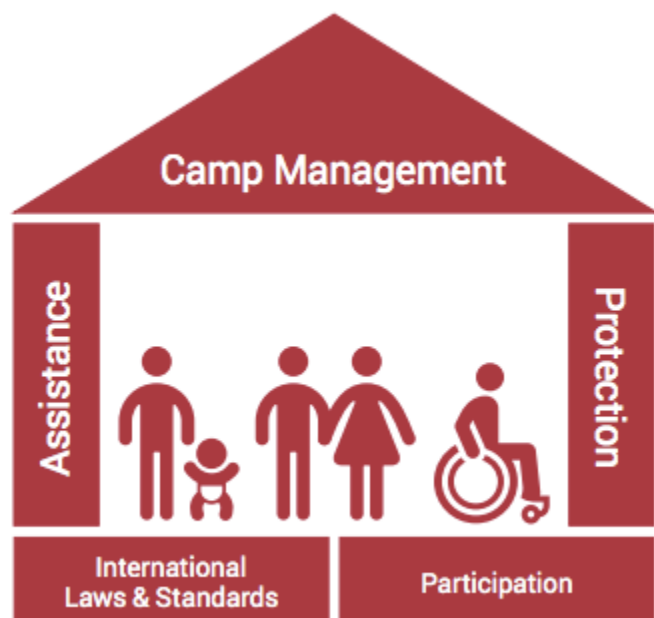
Camp Management House

A number of guidance documents, tools and other resources are available to support the implementation of CCCM in the field, to access these documents please reference the entry on Guidance Documents and Tools for Camp Coordination and Camp Management